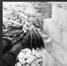
FAST AND EASY TOTHING