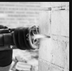
EXTRACT HARMFUL DUST