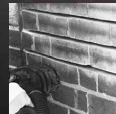
TUCKPOINTING AND MORTAR RESTORATION