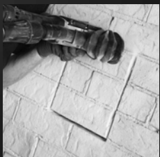
CUT SQUARE WITHOUT OVERCUTTING